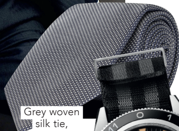
Grey woven silk tie, £75, Chester Barrie

YOUNG'S HIRE AT THE NATIONAL WEDDING SHOW