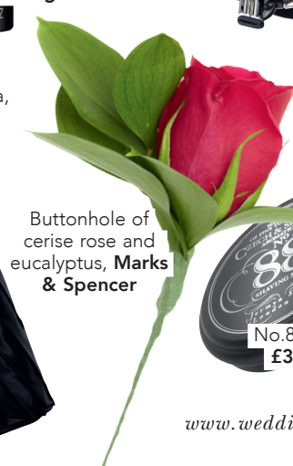
Buttonhole of cerise rose and eucalyptus, Marks & Spencer