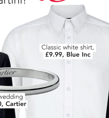
Classic white shirt, £9.99, Blue Inc