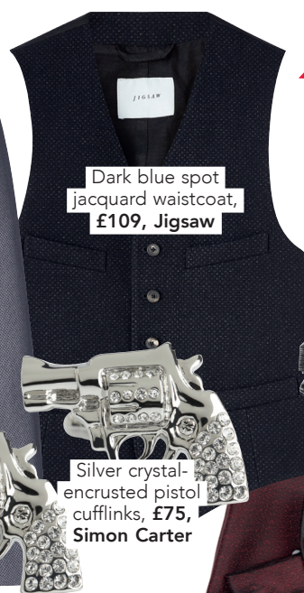
Dark blue spot jacquard waistcoat, £109, Jigsaw