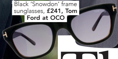
Black 'Snowdon' frame sunglasses, £241, Tom Ford at OCO