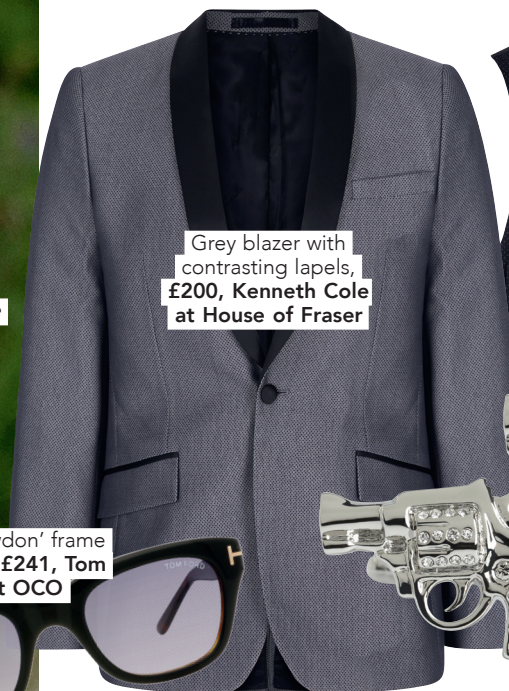
Grey blazer with contrasting lapels, £200, Kenneth Cole at House of Fraser