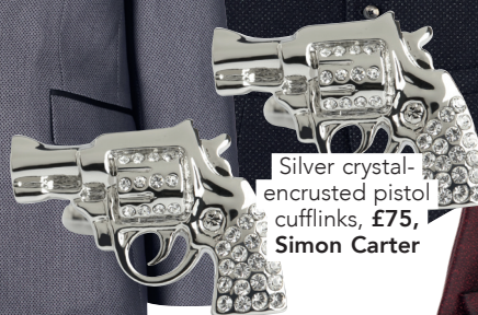
Silver crystal- encrusted pistol cufflinks, £75, Simon Carter