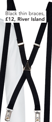
Black thin braces, £12, River Island