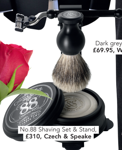
No.88 Shaving Set & Stand, £310, Czech & Speake