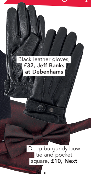
Black leather gloves, £32, Jeff Banks at Debenhams