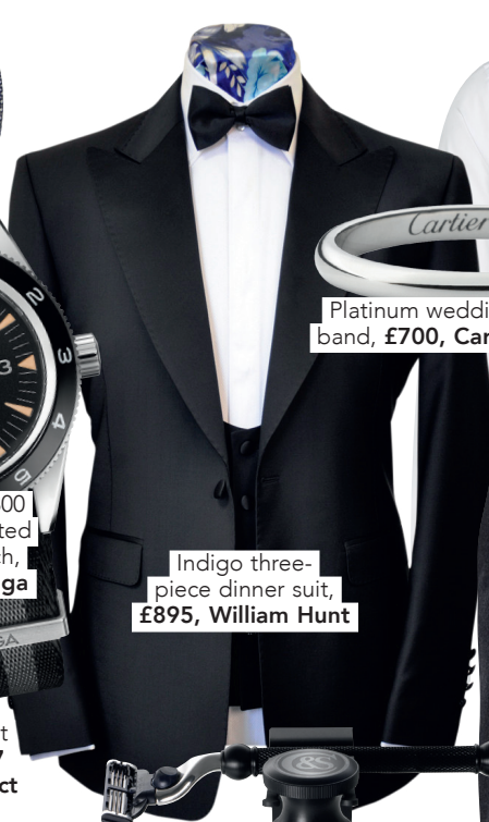
Indigo three- piece dinner suit, £895, William Hunt