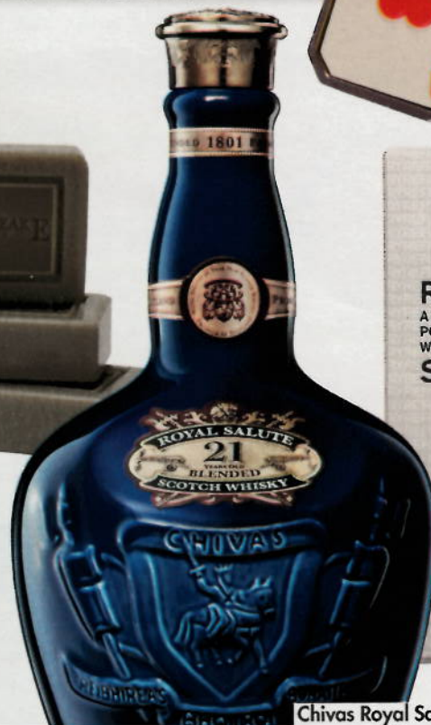
Chivas Royal Salute