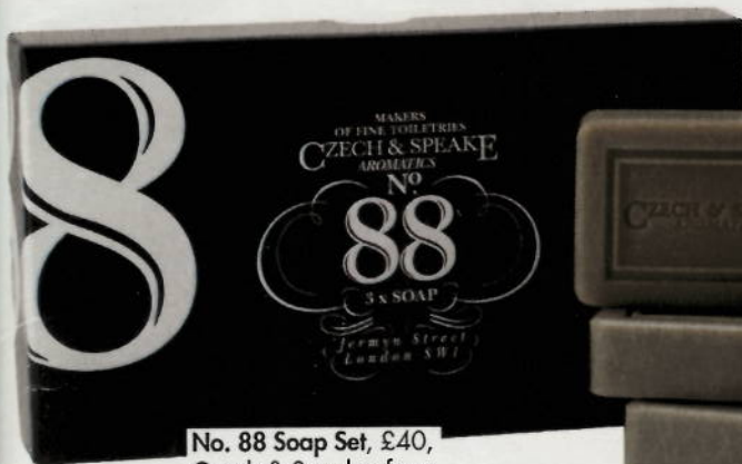
No. 88 Soap Set, £40, Czech & Speake; from harrods.com