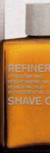
Refinery shave oil (30ml), £27,