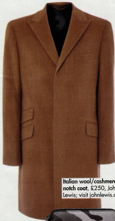
Italian wool/cashmere notch coat, £250, John Lewis; visit johnlewis.com