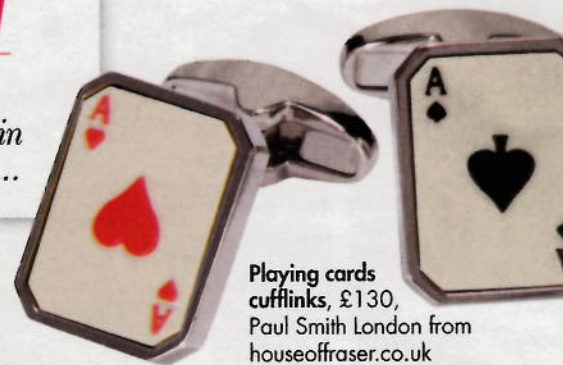
Playing cards cufflinks, £130, Paul Smith London from houseoffraser.co.uk