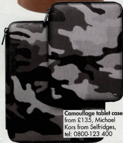
Camouflage tablet case, from £135, Michael Kors from Selfridges, tel: 0800-123 400