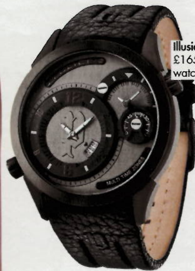
Illusion watch, £165, Police from watchshop.com