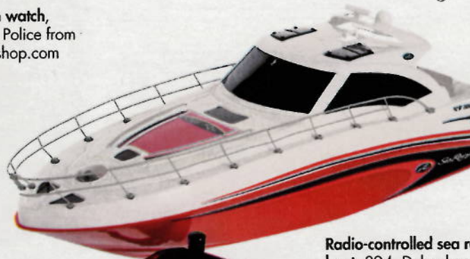
Radio-controlled sea boat, £24, Debenhams; visit debenhams.com